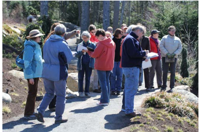
Both in the classroom and in the field, CMBG's certificate program covers the basic biology and ecology of native plants, then progresses toward advanced topics in horticulture, design and plant selection.

The certificate program requires eleven courses plus three electives of your choice.