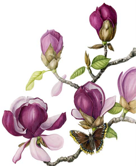
Mourning Cloak and Magnolia, Mindy Lighthipe ▲

Be inspired by our dynamic and talented instructors and nearly 325 acres of botanical diversity, beautiful vistas, seasonal displays, and remarkable plant specimens. From expressive plein air painting to detailed illustration, students can explore new ways to be creative while also delving deeper into the mediums they enjoy most. Each year we offer new classes as well as old favorites.